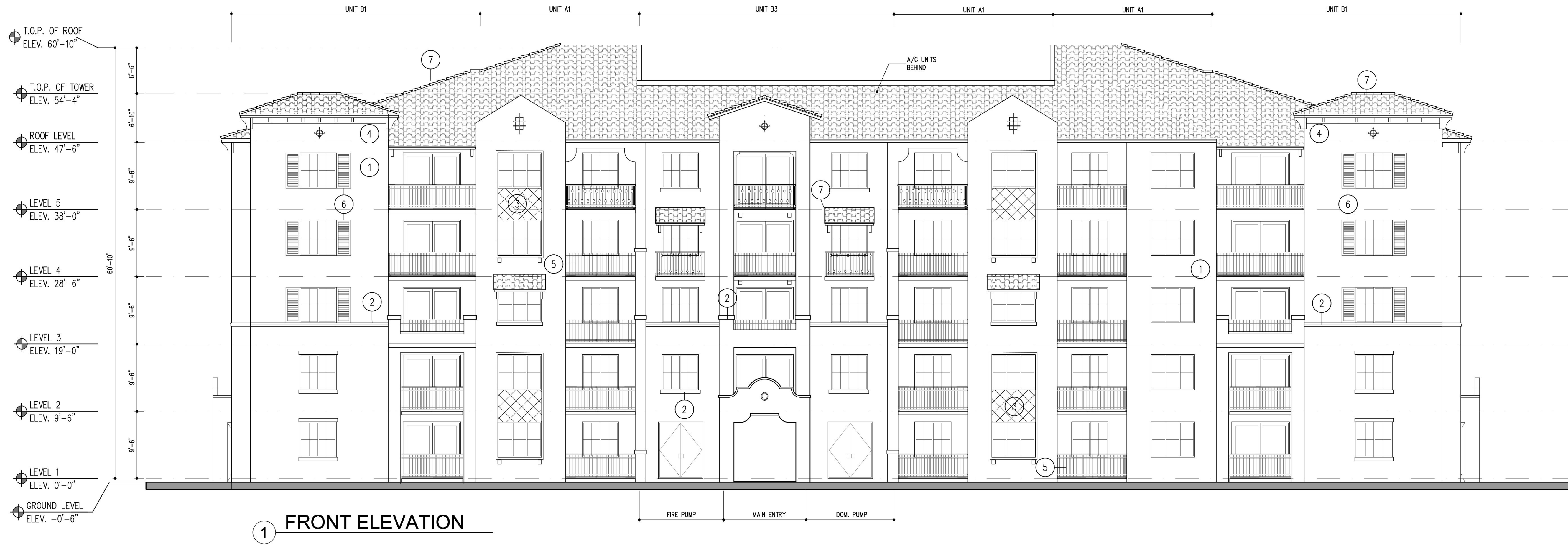
1 FRONT ELEVATION